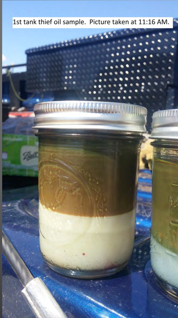
1st tank thief oil sample. Picture taken at 11:16 AM.