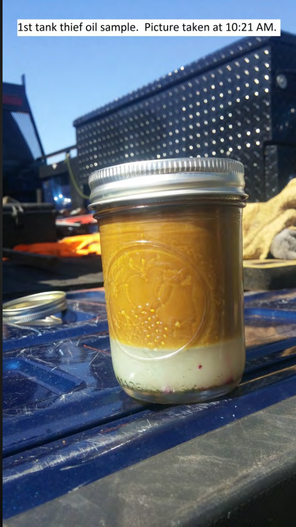
1st tank thief oil sample. Picture taken at 10:21 AM.