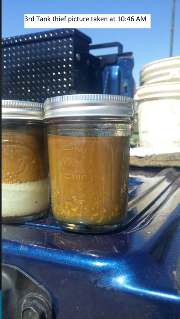
3rd Tank thief picture taken at 10:46 AM