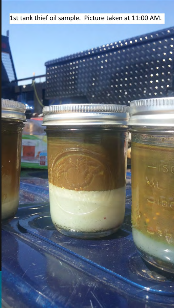
1st tank thief oil sample. Picture taken at 11:00 AM.