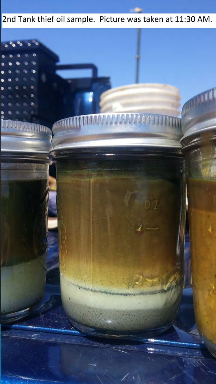
2nd Tank thief oil sample. Picture was taken at 11:30 AM.