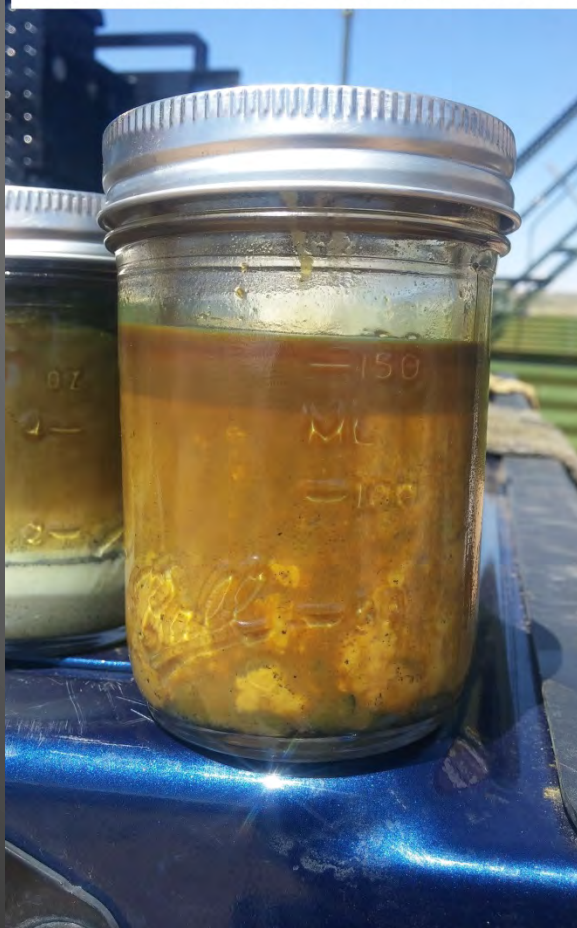
4th Tank thief oil sample. Picture was taken at 11:30 AM.