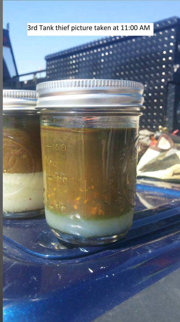
3rd Tank thief picture taken at 11:00 AM