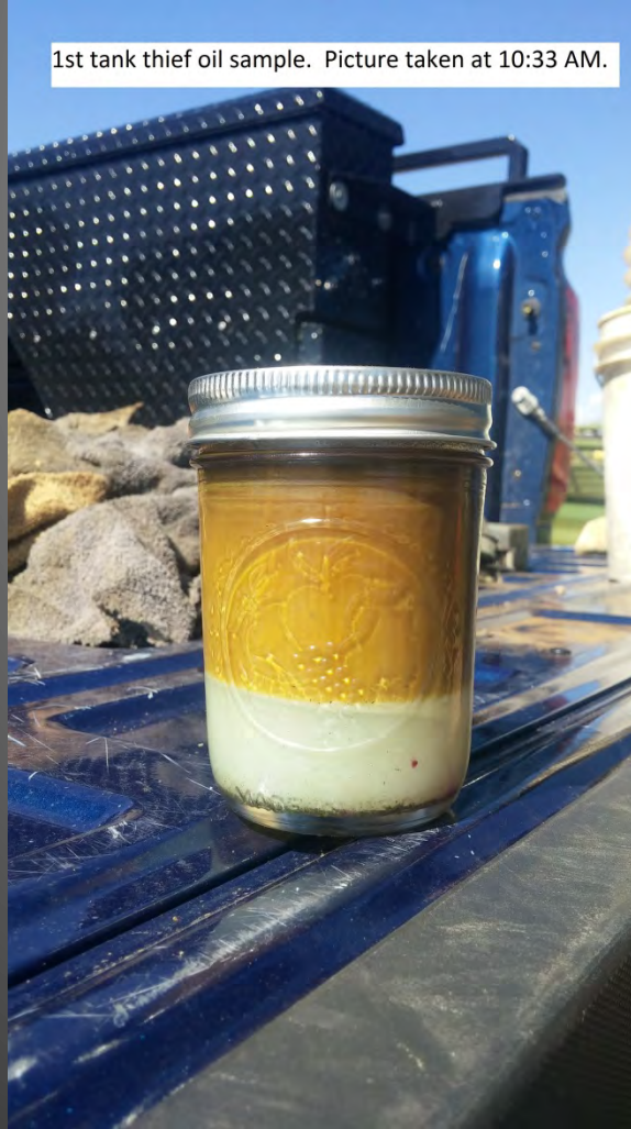
1st tank thief oil sample. Picture taken at 10:33 AM.