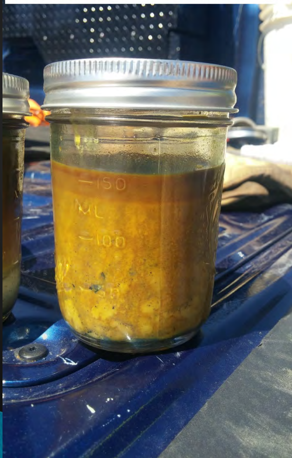
4th Tank thief oil sample. Picture was taken at 11:16 AM.